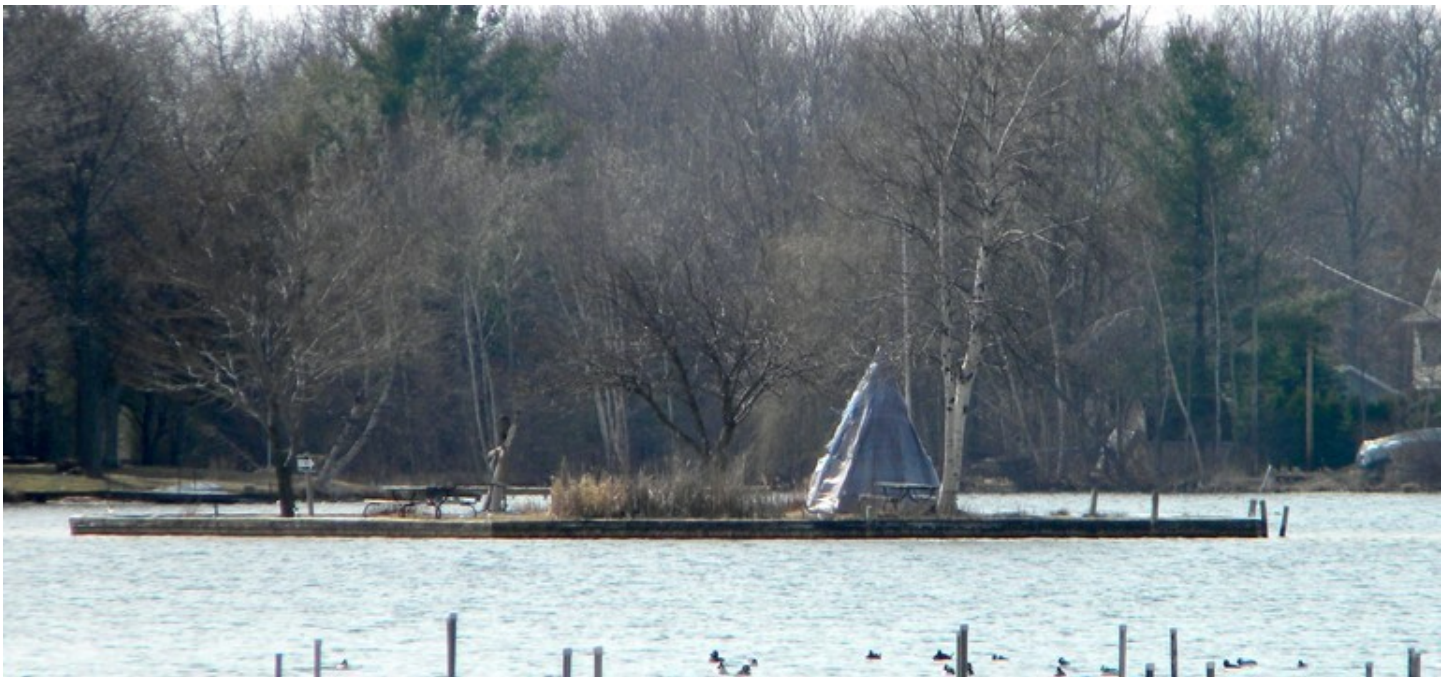
Tee-pee Island Early Spring

The Lake Shores Association operates under the direction of the Board of Directors. Members of the Board are homeowners just like those who volunteer their time to serve their community. They serve one-year terms and are elected by vote of the membership. The Board sets policy, establishes budgets, approves subcontractors, and makes all financial and legal decisions on behalf of the Association. The goal of the Board is to work together to provide preservation of the standards and amenities of our lakeside community.