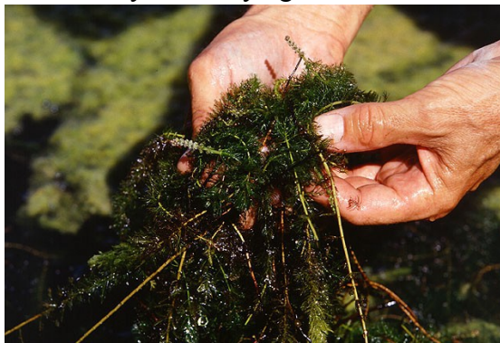
*EWM = eurasian watermilfoil