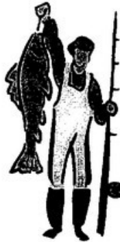
This could be YOU!

www.indianlakes.org and go to the members section.